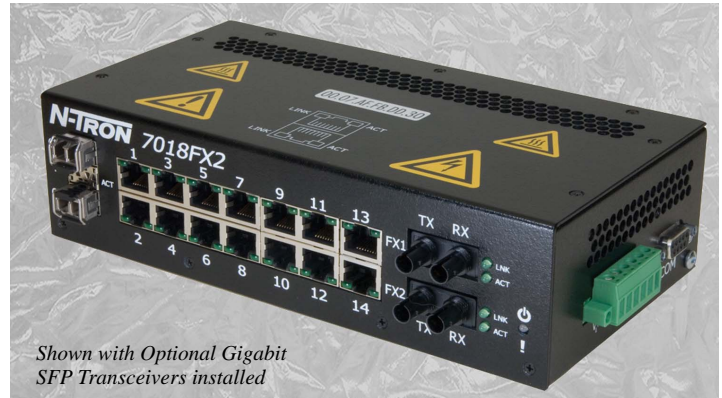
Shown with Optional Gigabit SFP Transceivers installed

DHCP -DHCP Server / Client automates the assignment of IP addresses. DHCP Option 82 assures that if a device on a specific port is replaced, the replacement receives the same IP address as the original device.