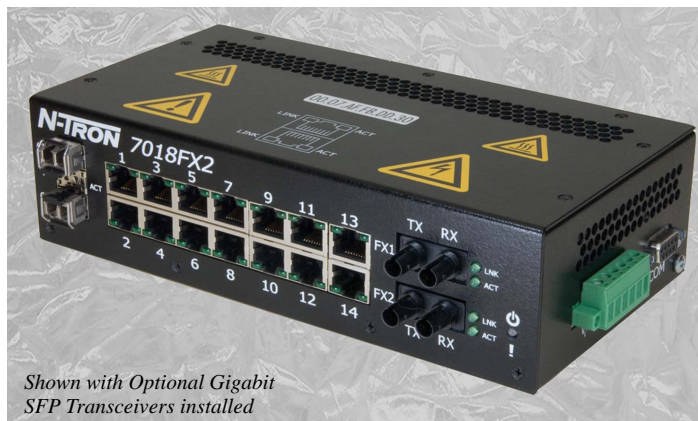
Shown with Optional Gigabit SFP Transceivers installed

DHCP -DHCP Server/Client automates the assignment of IP addresses. DHCP Option 82 assures that if a device on a specific port is replaced, the replacement receives the same IP address as the original device.