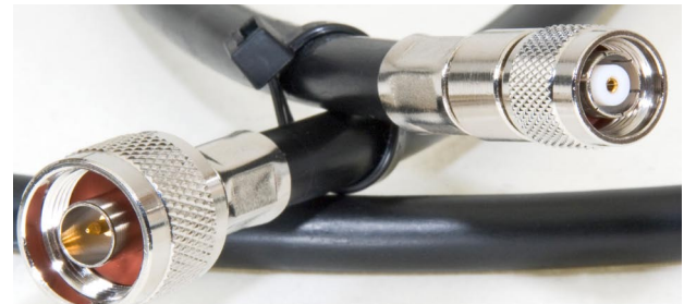
N-TRON ANT-CAB-400-N-RPTNC cable for use with the 702M12-W. N connector is pictured on left and RP-TNC connector on right