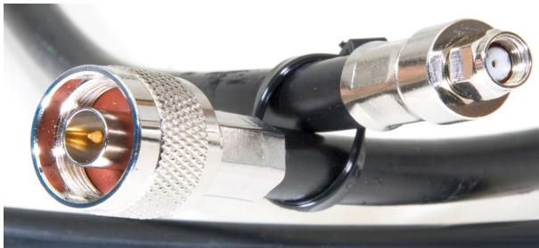
N-TRON ANT-CAB-400-N-RPSMA cable for use with 702-W. N connector is pictured on left and RP-SMA connector on right